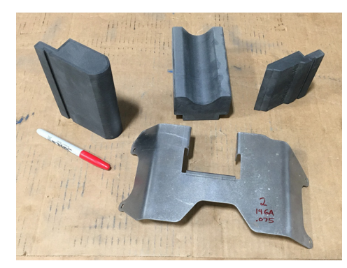
The 3D printed tools shown with one of the formed sheet metal brackets.